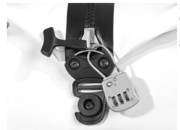
Wire loop for locking with padlock (padlock not included)